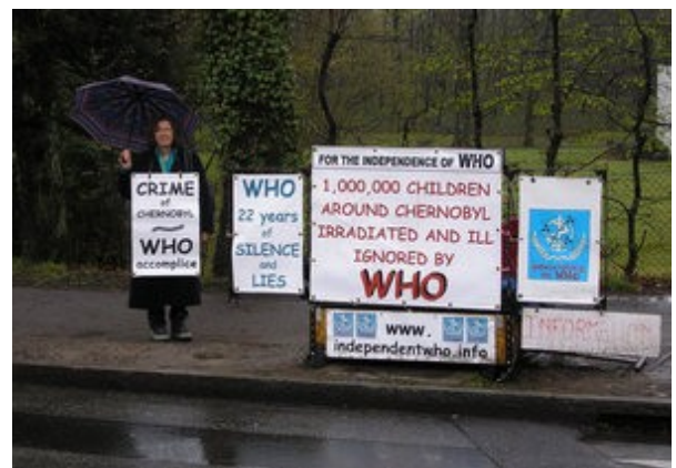
from 7th to 11th April 2008